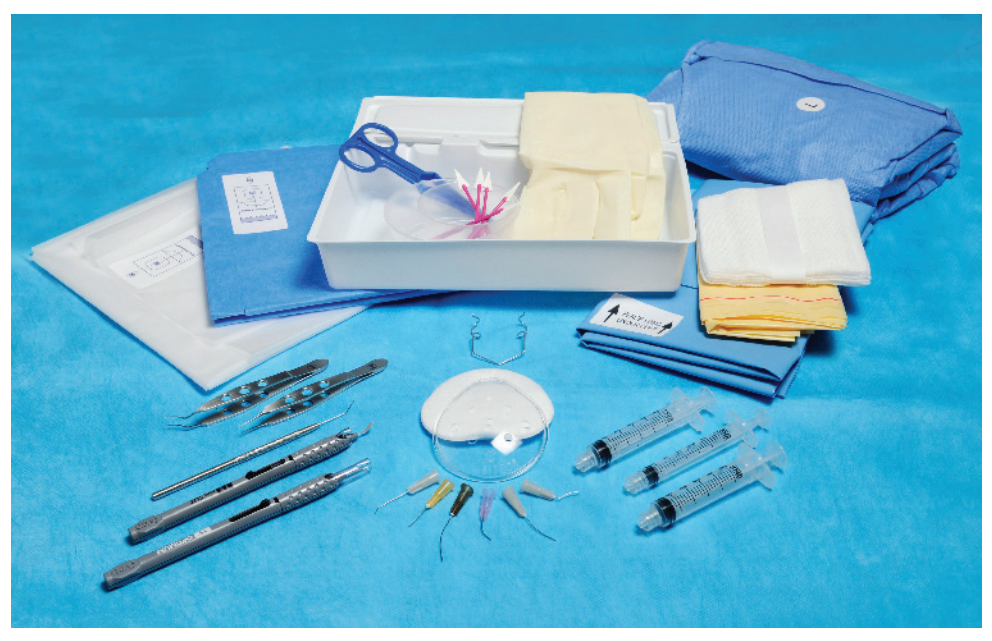
A Specialized Manufacturer of CustomEyes® Procedure Packs Since 1995

Select from a range of standard packs, or build your own customized surgery pack from one of the most extensive Cataract and Refractive product lines. CustomEyes® Procedure Packs feature single-use Beaver® knives, Visitec® instruments, drapes and cannulae, Merocel® fluid control devices, Wet-Field® Eraser® electrosurgical instruments, plus a full range of other components for ophthalmic surgery.